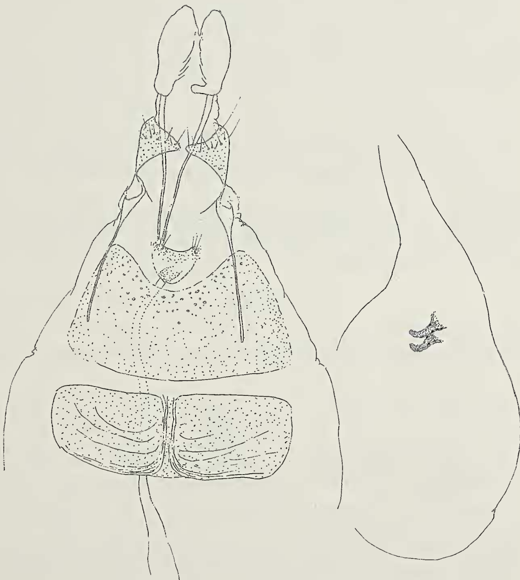
Fig. 2. Female genitalia of Lathronympha balearici sp. n., allotype.

Female genitalia (Fig. 2). Seventh abdominal sternite about twice as broad as high, upper edge angularly excised. Sterigma moderate, subtriangular or cordiform; lamella postvaginalis transverse, about twice as broad as high, upper edge concave, with wart-like lateral excrescences, each with 3—5 small bristles. Ductus bursae indefinite, apparently without any sclerites. Signa smaller than in L. strigana , larger than in albimacula V. Kuzn.